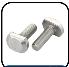
T - Bolt